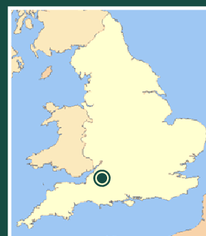
Avalon House, North Somerset

Learning: Successful boiler position and water tank positioning has been key